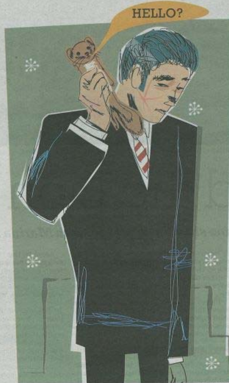
TNP ILLUSTRATIONS: SIMON ANG

Colebourn bought an animal for US$20 ($30) from a hunter who had killed its mother.